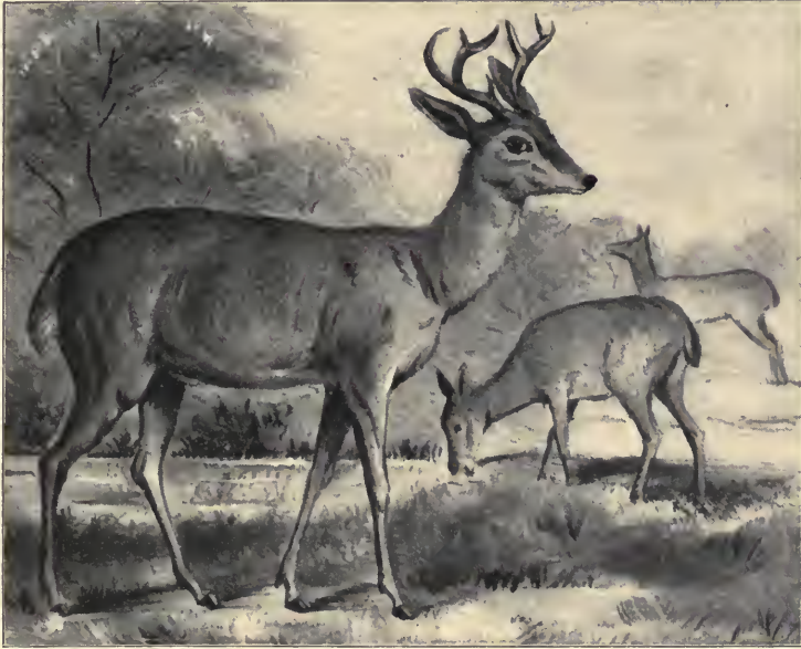
FIG. VIII. ODONTOCÆLUS A. COUESI. COUES'S WHITE-TAILED DEER.